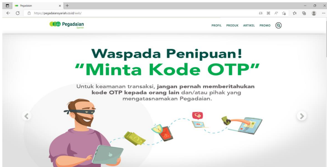
Picture 1. Home page of Islamic Pawnshop of Indonesia

In this research, data was received from official website which are: https://pegadaiansyariah.co.id/web/ ; https://pawnshop.com.my/?lang=ms and https://maidamproperty.com/ . Due to limited information especially for Malaysia pawnshop, researcher use two official website and here are the official website home page layout.